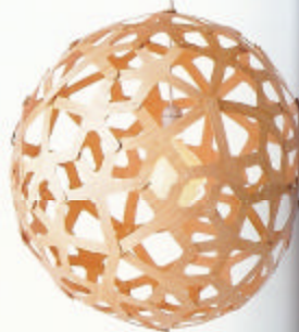
ECO-CHIC ACCESSORY Coral Pendant, $500; dwc.com